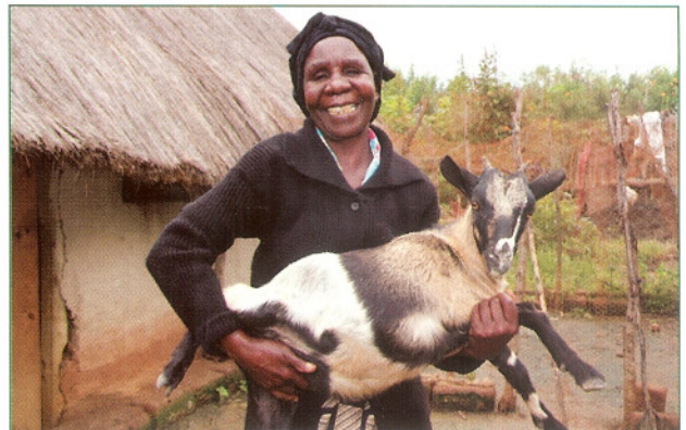
The lady receives goat as part of the goat pass on project