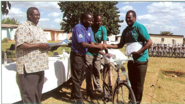
Care givers receiving tool kits and bicycles