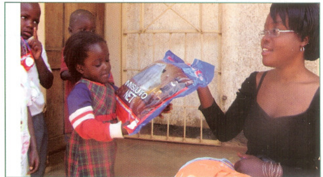
Mosquito nets being distributed under the malaria prevention program