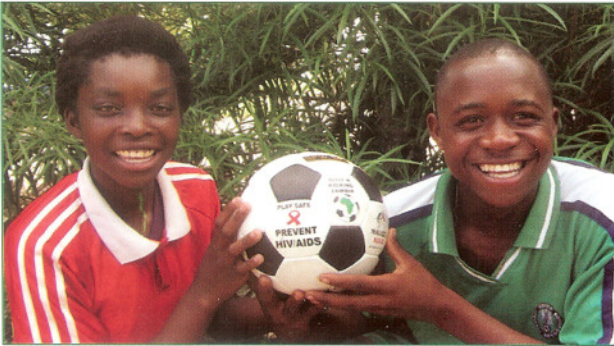
Games are used to sensitize the Youth on a number of issues